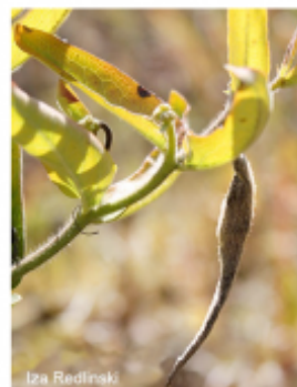
11 Asclepias tuberosa Butterfly weed Collect Sept-mid Oct. Look for hirsute pod and stem. Seed ready when pod and seed are brown. Usually few pods/plant.