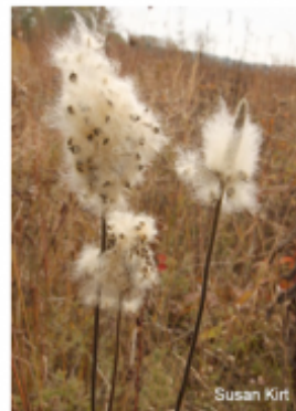
7 Anemone cylindrica Thimbleweed Collect mid-Aug. – Oct. Seeds ready to harvest if peduncle brown. Leaves w/ 3 distinct lobes.