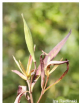
9 Asclepias incarnata Swamp milkweed Collect Sept. – Oct. Wait to collect until pods become brown. Do not burn the fluff to clean the seed.