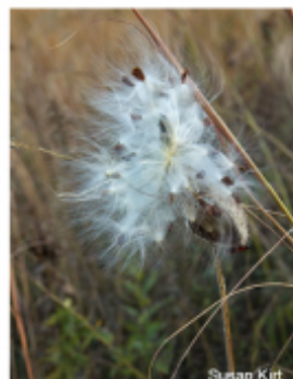
10 Asclepias syriaca Common milkweed Collect Sept. – Oct. Large pods with spikes. If pods do not have spikes and plant is shorter then it is A. sulivantii .