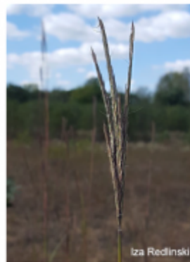
6 Andropogon gerardii Big bluestem Collect Oct. – Nov. Don't introduce too much seed into early restoration.