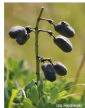
12 Baptisia spp. Wild indigo Collect mid-Aug. – Sept. Remove seed from pods to prevent weevils from foraging. Scarify seed.