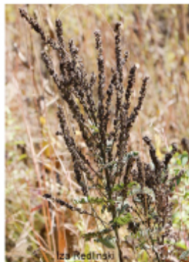
5 Amorpha canescens Lead plant Collect mid-Aug. – Oct. Remove hulls when cleaning, each pod contains 1 round seed.