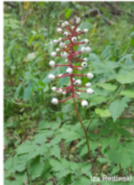
1 Actaea pachypoda White baneberry/ Doll's eyes Collect in Sept. Ivory white berries, each with a black dot; large compound leaves.

[fieldguides.fieldmuseum.org] [919] version 1 10/2017