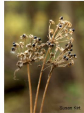
4 Allium tricoccum Wild leek Collect in Oct., in mesic woods. Seed is round, black and shiny.