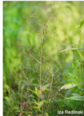
2 Alisma subcordatum Common water plantain Collect Sept. – Oct. Conspicuous seed in small balls at the end of a peduncle.